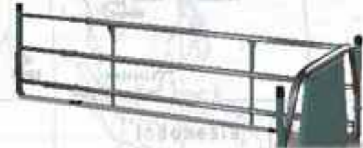
S.S. COLLAPSIBLE RAILING