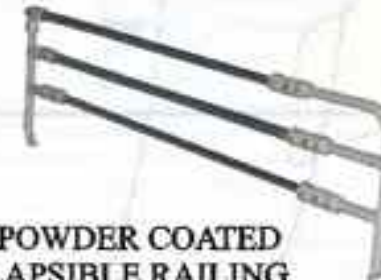
M. S. POWDER COATED COLLAPSIBLE RAILING

SELECT THE REQUIRED PARTS OF THE BED AND FORWARD US BY EMAIL, FAX AND WE WILL QUOTE YOU THE PRICES ASAP.