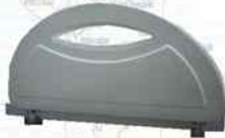
ABS PLASTIC SWING TYPE RAILING