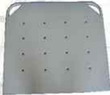
PERFORATED SHEET TOP