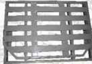
TRAPEZOID TYPE TOP