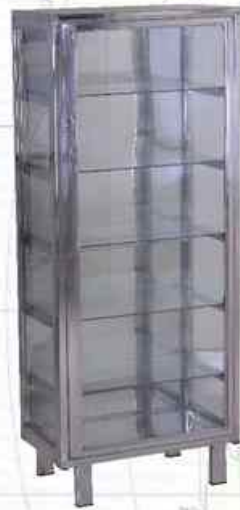
Instrument Cabinet [D4S 30]

Overall Size : W 610 mm x D 355 mm x H 1525 mm Frame : CRCA Rectangular tube, CRCA sheet panels