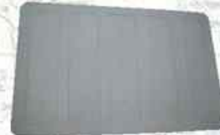
ABS PLASTIC TOP