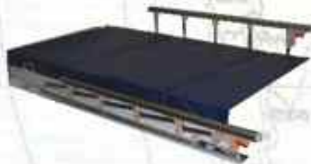
ALLUMINIUM COLLAPSIBLE RAILING