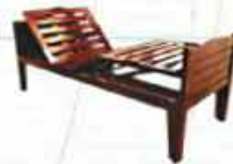
Backrest + Legrest Position