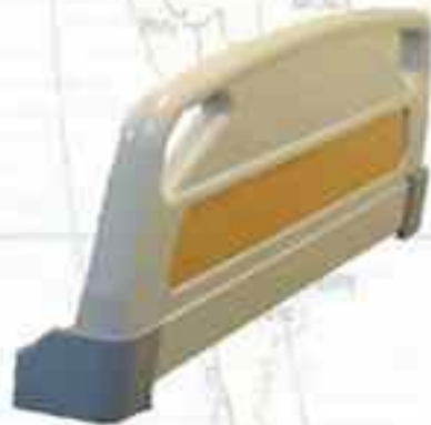
ABS PLASTIC BOARDS