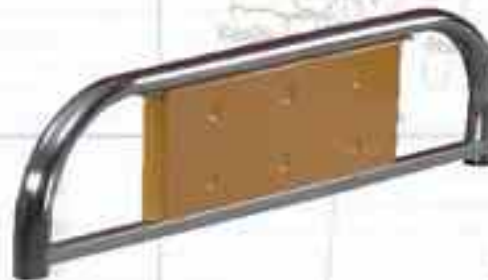
S.S. METAL BOWS