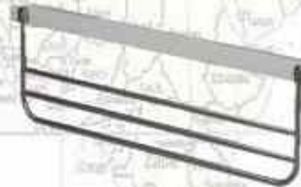
S.S. SWING TYPE RAILING