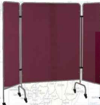
Bed side screen [D4S 13]

Overall Size : L Open 2360 mm / close 1200 mm x W 550 mm x H 1730 mm