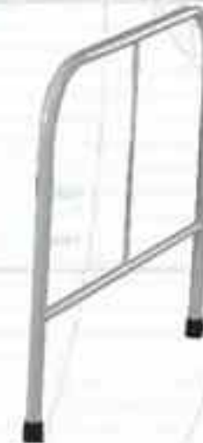
M.S. POWDER COATED BOWS